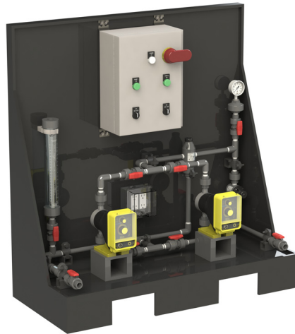
LMI Version with LCP2