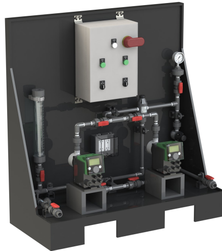
Grundfos Version with LCP2